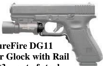
SureFire DG11 for Glock with Rail 103.- out of stock