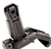
MAGPUL MBUS PRO Offset Rear out of stock