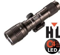
Streamlight ProTac Rail Mounted HL-X* 180.- out of stock