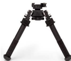
ATLAS V8 Bi-Pod 4.75-9" BT10-LW17 American Defense QD Mount 325.- out of stock

ATLAS PSR additional features: Fore and after pivot limiting Bosses Non-Rotating Legs Range of elevation is 7 – 13" on BT47