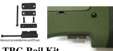
TRG Rail Kit BT29 43.- out of stock