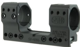
SPUHR SP-4006 Ø 34mm, Height 34mm 0 MIL / 0 MOA 388.-