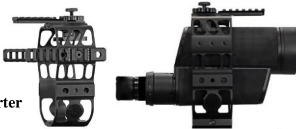
CADEX Inverter 385g For LEUPOLD Mark4 Spotting Scopes Designed for soft case use Recommended with TMR, Mil Dot, Inv. H32 or Inv. H36 Reticle 375.-