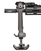
None U-type mount at the end of the Picatinnyrail