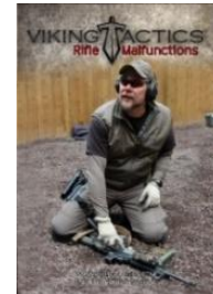
VTAC Rifle Malfunctions 1 Disc 38.-