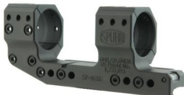
SPUHR SP-4616 Ø 34mm, Height 38mm 6 MIL / 20.6 MOA 421.- out of stock