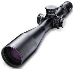
STEINER MILITARY 5-25x56 G2B 3100.- MSR-2 3200.-