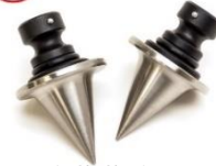
ATLAS Spikes 5-H BT58 90.-