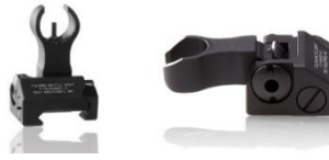
Troy folding Battlesight Rear 170.- oos Rear Tritium 235.- oos