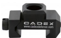
CADEX QD Sling Mount 43.-