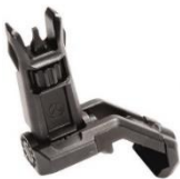
MAGPUL MBUS PRO Offset Front 105.-