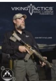
VTAC Basic Carbine Fundamentals 1 Disc 40.-