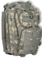
Army Digital Ad