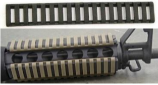
MAGPUL Ladder Rail Protector Covers 17 slots of rail blk/fde 14.-