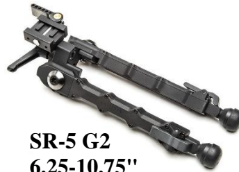
SR-5 G2 6.25-10.75" 395.- out of stock