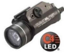
Streamlight TLR-1 HL blk 205.- fde/deb 212.-