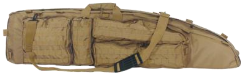
51" Drag Bag Od 225.- out of stock