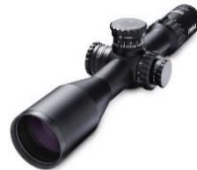
STEINER MILITARY 2.9-20x50 G2B 3581.- MSR-2 3699.-