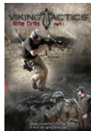
VTAC Rifle Drills 1 1 Disc 38.-