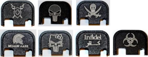
Back Plate for all GLOCK's except G42, G43 and all Gen5 Swiss Cross / Punisher / Calico Jack Molon Labe / Punisher Kitty / Infidel / Biohazard 25.-