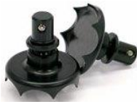
ATLAS Cleat Feet BT24 65.-