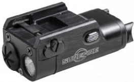
SureFire XC1-B 305.- out of stock