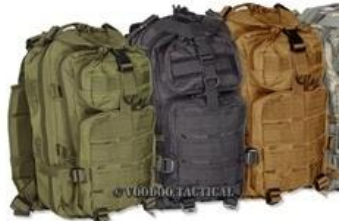
OD Green Od