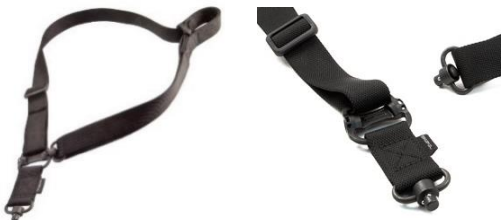
MAGPUL MS4 blk/fde 83.- out of stock