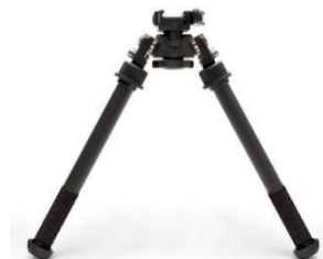
ATLAS PSR Bi-Pod 7-13" BT47-LW17 American Defense QD Mount 400.- out of stock