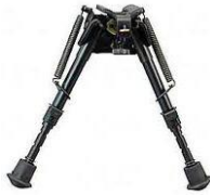
Harris BRMS 6''-9'' Rotating with Leg Notches 145.- out of stock