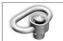
Heavy Duty QD Swivel 25.- out of stock