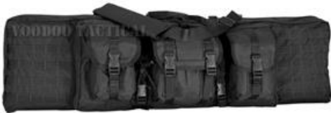
46" Weapons Case Od 165.- out of stock