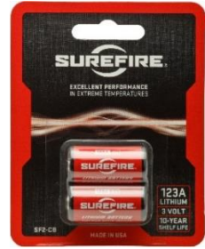
SureFire 3 Volt SF123 2-Pack 6.-