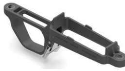
MagWell for Hunter 700 Incl. 1 pce PMAG 5 100.-