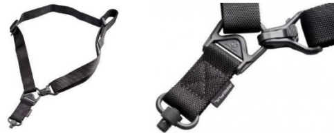
MAGPUL MS3 Single QD Sling blk/fde 80.-