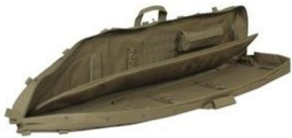
60" Drag Bag Out of stock 270.-