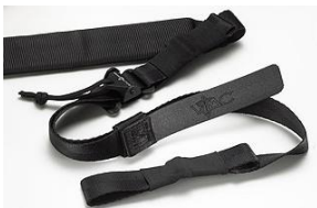
VTAC Wide Padded Sling – Upgrade fde 68.-