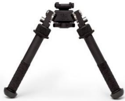
ATLAS V8 Bi-Pod 4.75-9" BT10 2 Screw Clamp (Picatinny) 280.- out of stock