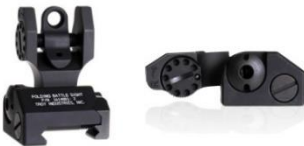
Troy folding Battlesight Front HK out of stock Front HK Tritium out of stock