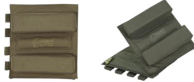
2 Piece Hard Bottom Rifle Guides Blk/Ad 30.-