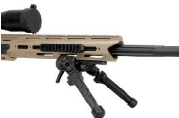
45° forward or rearward