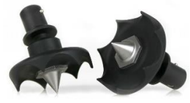
ATLAS Spiked Cleat Feet BT64 85.- out of stock