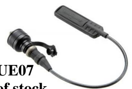
SureFire UE07 100.- out of stock