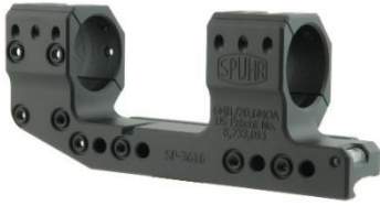
SPUHR SP-3616 Ø 30mm, Height 38mm 6 MIL / 20.6 MOA 421.- out of stock