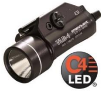
Streamlight TLR-1s 170.- out of stock