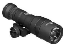
SureFire M300 305.- out of stock