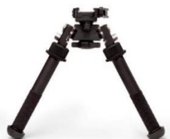
ATLAS PSR Bi-Pod 5-9" BT46-LW17 American Defense QD Mount 375.- out of stock