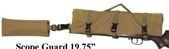
Scope Guard 19.75" Od 35.- out of stock