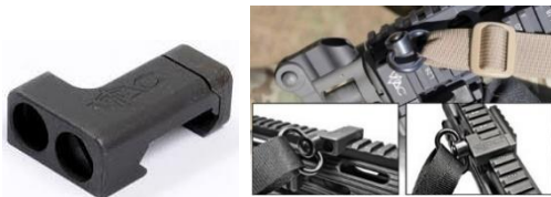
VTAC LPSM 50.-