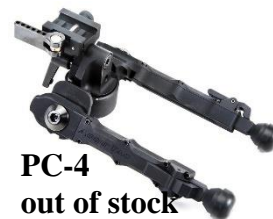
PC-4 out of stock 450.-