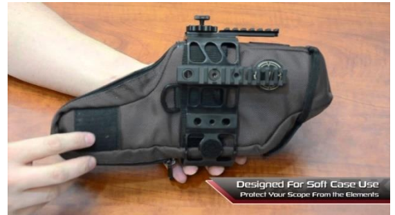
Designed For Soft Case Use Protect Your Scope From the Elements