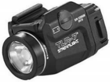
Streamlight TLR-7 180.-