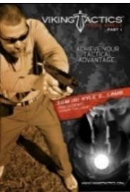
VTAC Pistol Drills 1 1 Disc 38.-