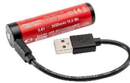
SureFire 18650 Micro USB Rechargeable Battery 3,6V 3500mAh Single 25.-