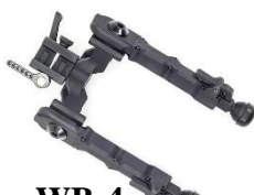
WB-4 out of stock 410.-