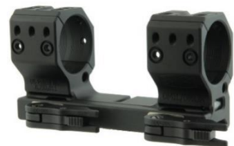
SPUHR QDP-4002 Ø 34mm, Height 38mm 0 MIL / 0 MOA 471.- out of stock