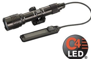
Streamlight ProTac Rail Mounted 2 165.-