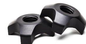
ACCU-TAC Spikes Claws 48.-