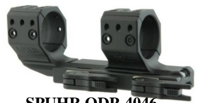
SPUHR QDP-4046 Ø 34mm, Height 34mm 0 MIL / 0 MOA 471.- out of stock