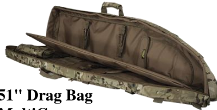
51" Drag Bag MultiCam 260.- out of stock