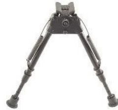
Harris LMS 9''-13'' Rotating with Leg Notches 145.-