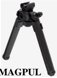
MAGPUL 2 Screw Clamp (Picatinny) fde 145.-