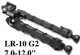
LR-10 G2 7.0-12.0" 425.-