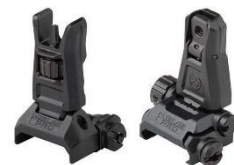
Set MBUS PRO Front & Rear out of stock