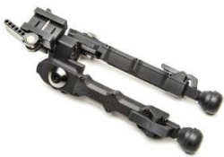
BR-4 G2 5.5-8.25" 380.-