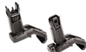
Set MBUS PRO Offset Front & Rear out of stock