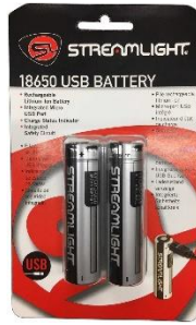
STREAMLIGHT 18650 Micro USB Rechargeable Battery 3,7V 2600mAh 2-Pack 42.-