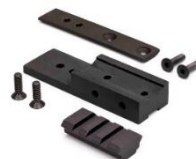
ATLAS TRG Bracket BT21 65.-