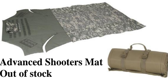
Advanced Shooters Mat Out of stock 170.-