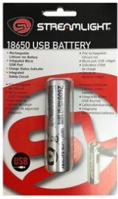
STREAMLIGHT 18650 Micro USB Rechargeable Battery 3,7V 2600mAh Single 23.-