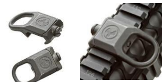
MAGPUL RSA 40.-