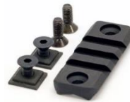
AFAR Kit BT28 43.-