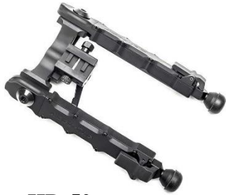
HD-50 7.0-10.0" 490.-