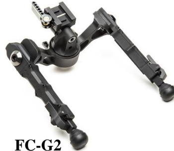
FC-G2 5.25-8.25" 555.- out of stock