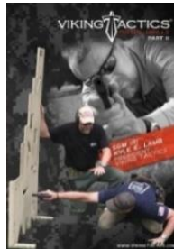
VTAC Pistol Drills 2 1 Disc 38.-