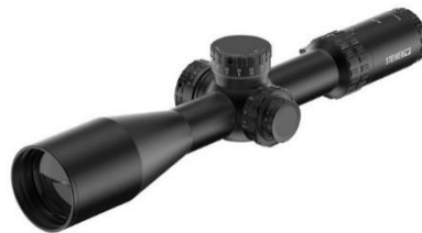
STEINER Military 4-28x56 G2B 3699.- MSR-2 3819.-

Most STEINER MILITARY Scopes are also available in coyote brown All STEINER MILITARY Scopes on request