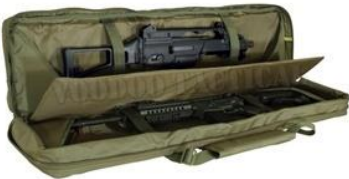
42" Weapons Case Out of stock 150.-