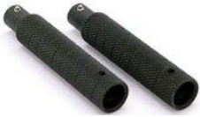
ATLAS Leg Extension 3" BT22 65.-