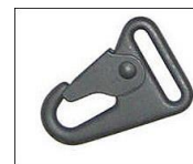
VTAC 1" Hook 14.-