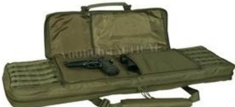
42" Weapons Case MultiCam 152.- out of stock