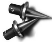
ATLAS Spikes BT37 65.-