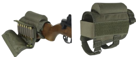
Buttstock Cheek Piece Out of stock 35.-