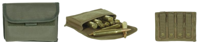
10 Round 50 cal or .408 Mag Pouch Blk/Coy/Od 25.-