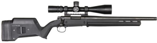
Hunter 700 Short Action For Remington 700 SA blk/fde 350.-