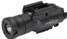
SureFire XH35 305.- out of stock