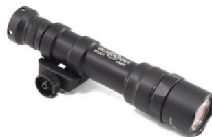
SureFire M600DF** 320.- out of stock