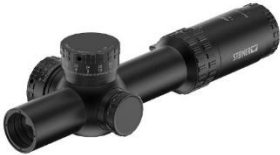
STEINER Military 1-8x24 DMR8i black 3222.- coyote 3663.-