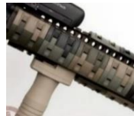
XTM Rail Panel 16 slots of rail 8 Elements same colour blk/fde/odg 14.-