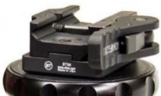
Adapter Picatinny - TriPod BT56-L 115.-