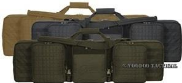
42" Deluxe Weapons Case Coy/Od 180.-