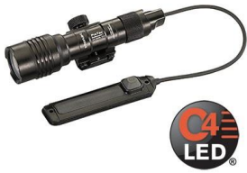
Streamlight ProTac Rail Mounted 1 153.- out of stock