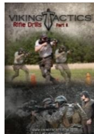
VTAC Rifle Drills 2 1 Disc 38.-