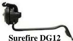
Surefire DG12 for S&W M&P 103.-