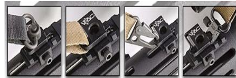
VTAC L.U.S.A. 63.-