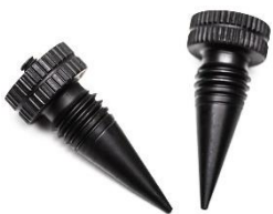
ACCU-TAC Spikes 48.-