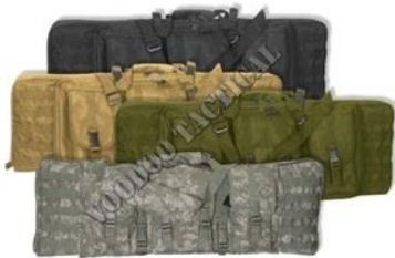
36" Weapons Case Coy/Od 145.-