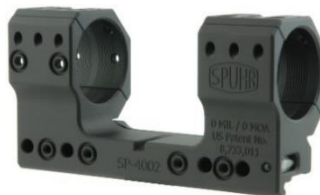
SPUHR SP-4002 Ø 34mm, Height 38mm 0 MIL / 0 MOA 388.- out of stock