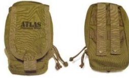
ATLAS BiPod Pouch BT30 Black/Coyote/Green 45.-