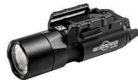
SureFire X300U-A fde 305.- out of stock