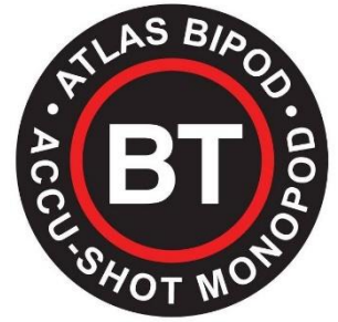
ATLAS 5-H Bi-Pod 5.5-10.5" BT35-LW17 535.- out of stock